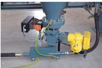
Installed Outlet control valve