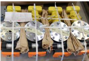
Outlet control valves